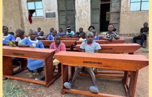
SCHOOL DESK PROJECT COMPLETED