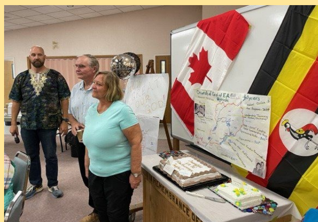
40th ANNIVERSARY CELEBRATION IN AUGUST AT THE WETASKIWIN CHURCH OF GOD, HONOURING 40 YEARS OF THE CHURCH OF GOD IN UGANDA, ALONG WITH CELEBRATING 35 YEARS THE FURAHA CHILD SPONSORSHIP PROGRAM HAS PARTNERED WITH THE MINISTRY IN UGANDA TO CARRY OUT THIS PROGRAM AND SPECIFIED PROJECTS AND RELIEF.