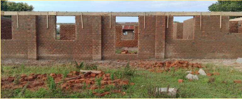
Katakwi Church Roof Repair—Building now ready for roof installation.