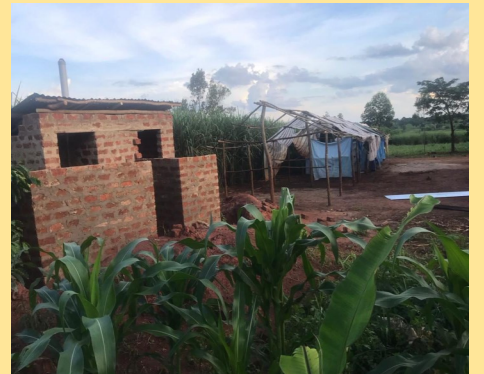
TOILET SANITATION PROJECT COMPLETED (5 Star School)